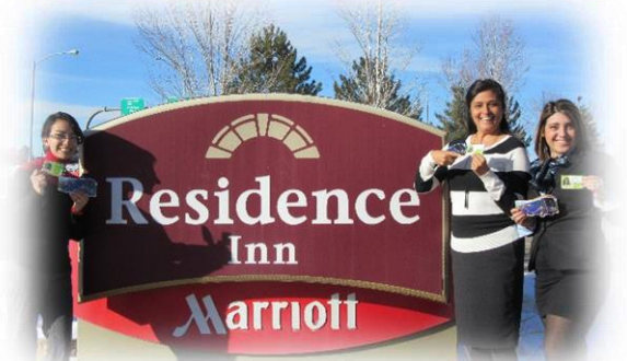
Residence Inn Employees receive their 2016 passes.